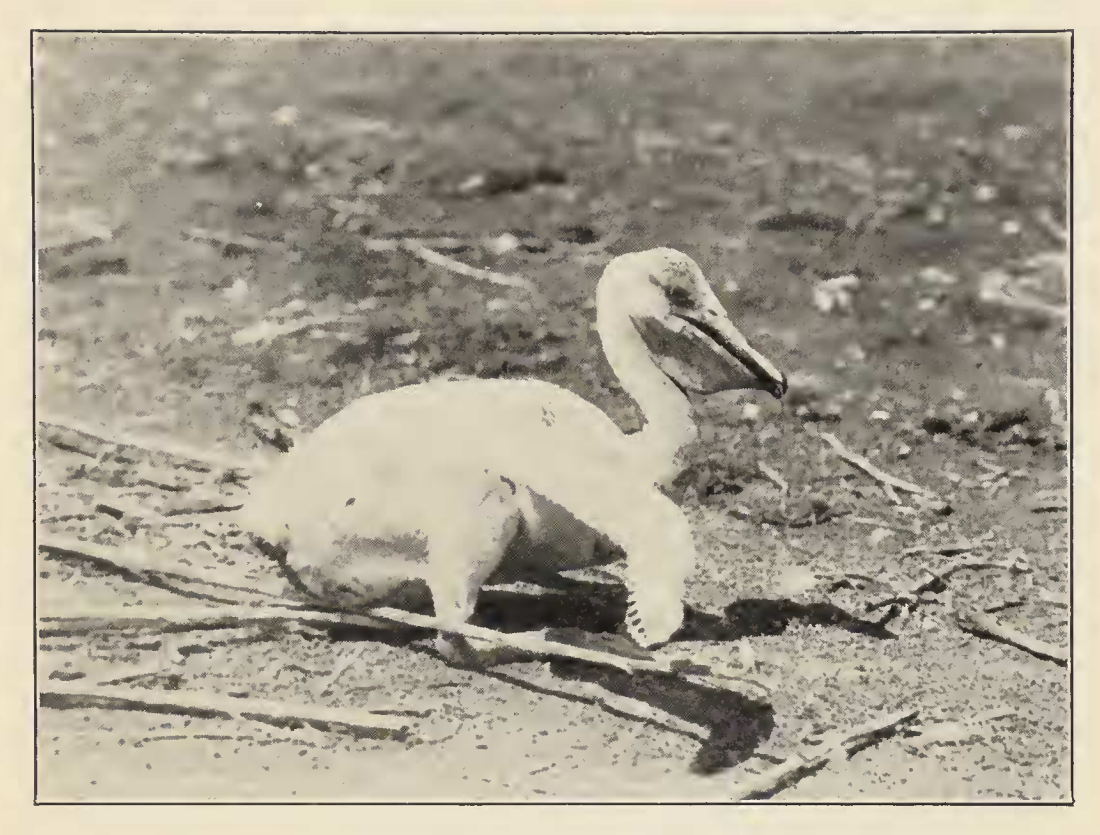
YOUNG PELICAN WALKING "His head was going forward and backward, as he walked, similar to that of a camel."